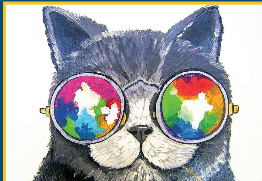
Artwork by Kairos clients | Design by Michaels & Michaels Creative, LLC